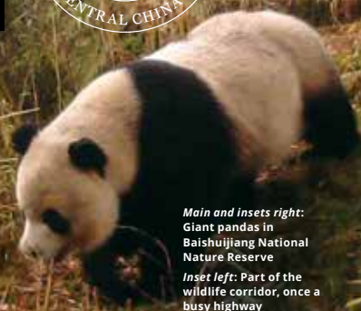
Main and insets right: Giant pandas in Baishuijiang National Nature Reserve Inset left: Part of the wildlife corridor, once a busy highway

"I KNOW YOU'LL BE AS THRILLED AS WE ARE AT THIS AMAZING PANDA COMEBACK, AND IT'S A REALLY POSITIVE SIGN THAT CONSERVATION EFFORTS YOU SUPPORT ARE WORKING"