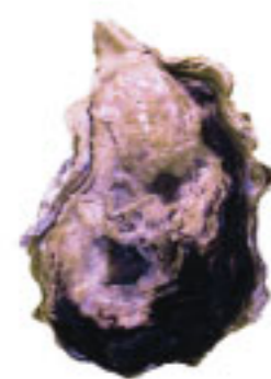
Rock oyster Saccostrea cucullata