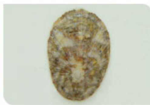
Limpet Cellana toreuma