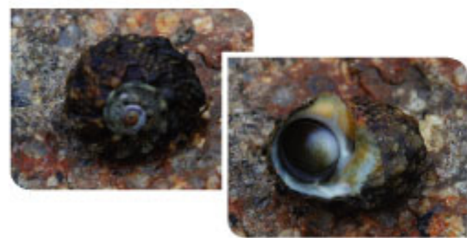
Coronate turban shell Lunella coronata