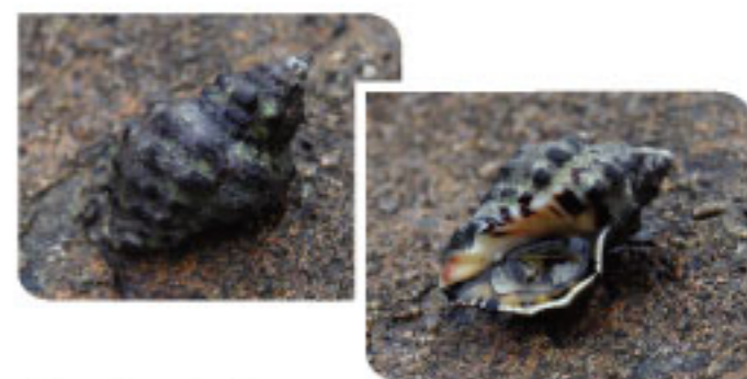
Oyster drill Thais clavigera