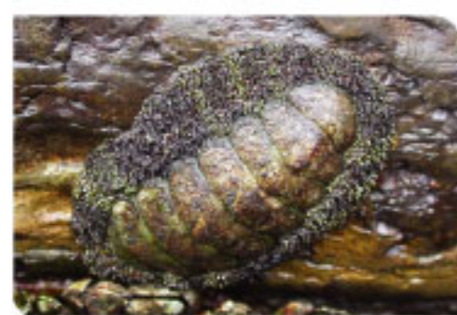
Chiton Acanthopleura japonica