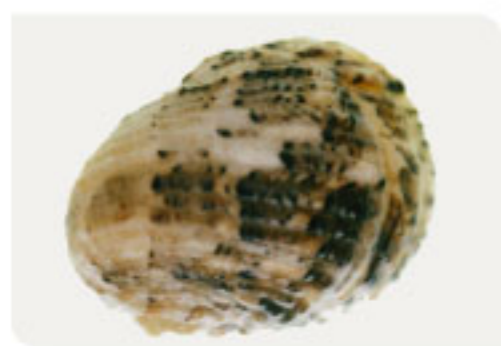
Chameleon nerite Nerita chamaeleon