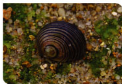
Nerite Nerita costata