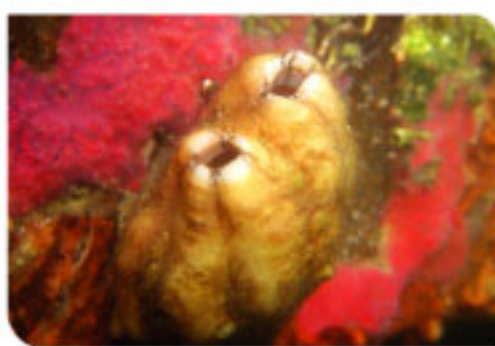
Sea squirt Styela plicata