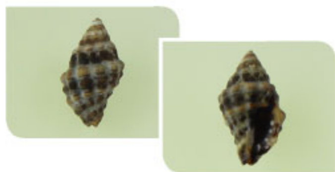
Dogwhelk Morula musiva