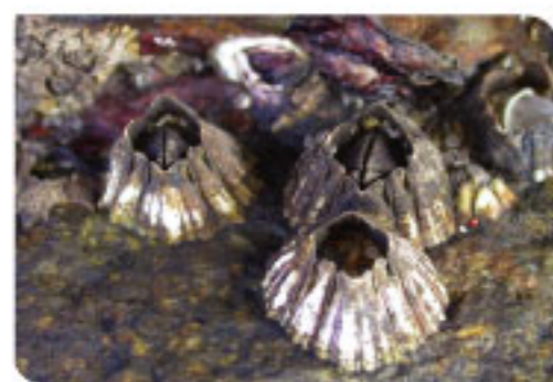
Amphitrite's rock barnacle Balanus amphitrite