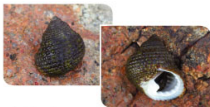
Toothed monodont Monodonta labio