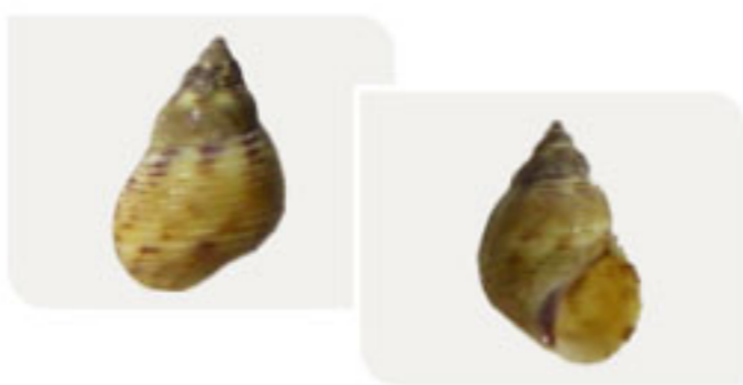
Periwinkle Littoraria articulata