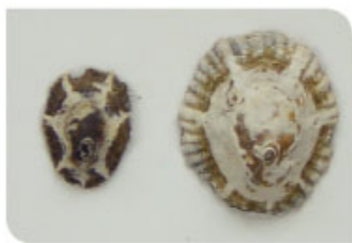
Seven-rayed limpet Patelloida saccharina