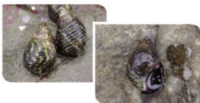
Planaxis snail Planaxis sulcatus