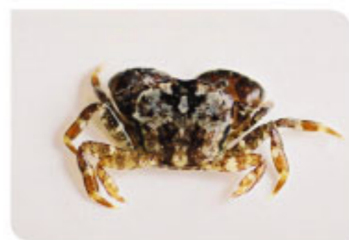
Shore crab Hemigrapsus penicillatus