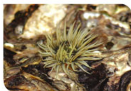
Rock anemone Haliplanella luciae