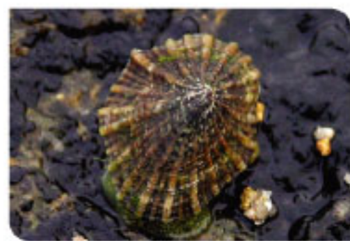
Japanese limpet Siphonaria japonica